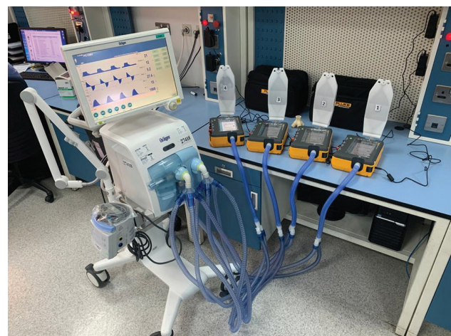
FIGURE 3. Four-way splitter implemented on a V500 ventilator with four test lungs.

that overheating of the motor would limit the device, and a 24-hours period was deemed sufficient time to test its limits.