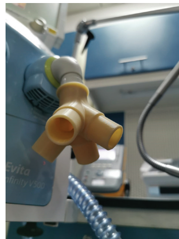
FIGURE 2. Four-way splitter placed on the inhalation branch of the ventilator.