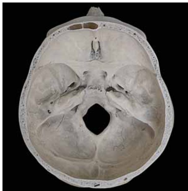
Picture 4. Cranial base - occipital symmetry with right temporoparietopetalia

D In all the cases of anteroposition of the occipital part of the skull, as well as temporal bone pyramid, posterior fossa of the skull shows anteroposition on the same side. The middle cranial fossa, according to its position in the middle of the skull, as well as its relation with sphenoid bone, shows great difference with respect to posterior fossa. The middle fossa corresponds to the appearance of the occipital part in 47 % of all the examined specimens, and the anterior fossa in 70 %.