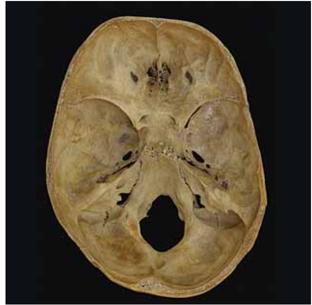
Picture 6a. Alginate imprint of middle cranial fossa at right occipitopetalia