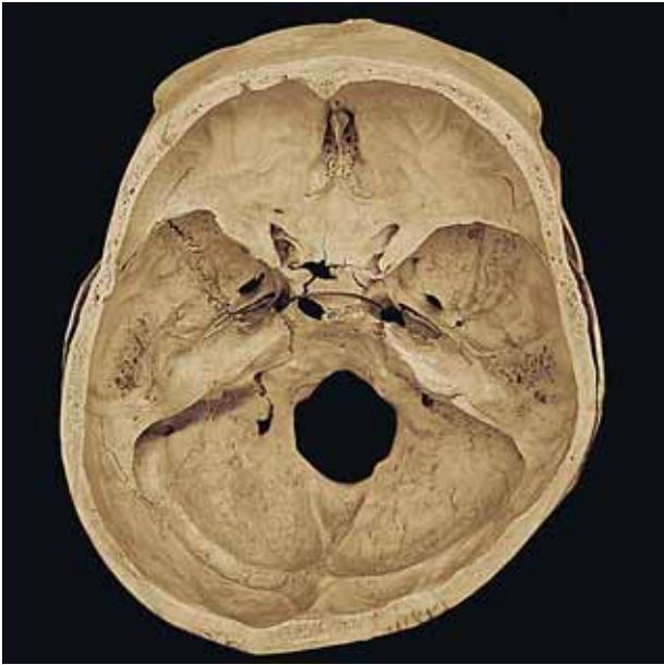
Picture 5. Cranial base - left occipitopetalia