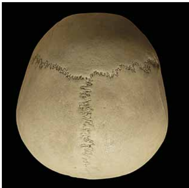
Picture 1. Occipital symmetry

In this group of skulls the most frequent type is left occipitopetalia associated with protuberance on the contralateral side, i.e. with right temporoparietopetalia. Total of 16 % of the investigated cases.