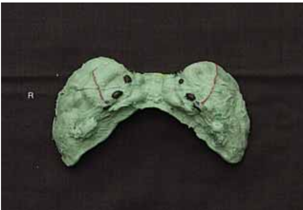
Picture 5a. Alginate imprint of middle cranial fossa at left occipitopetalia