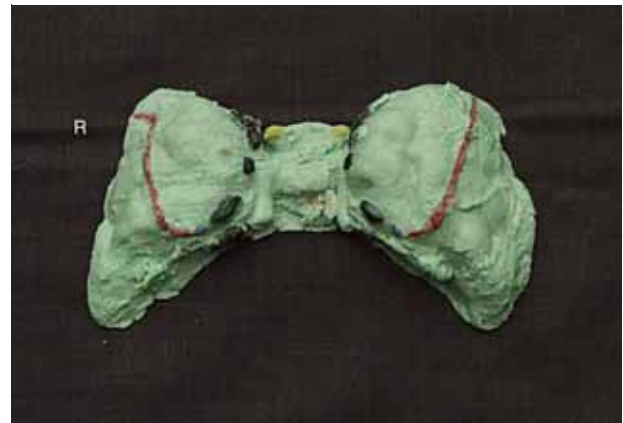
Picture 6. Cranial base - right occipitopetalia