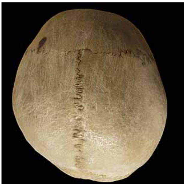
Picture 3. Right occipitopetalia