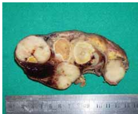
FIGURE 2. Cut surface: tumor nodules comprime but do not invade testicle parenchima leading to its atrophy

A 56-year-old white male who was performed the small intestine resection in extent of approximately 1 m length, upon strong and persistent intraabdominal pain was found to have a mesenchymal tumor of the jejunum. Grossly, the middle part of resected intestine a lumen was globularly expanded (16x16 cm) and wall was thickened up to 2 cm, diffusely penetrated with grey white tumor mass. Pathologic examination revealed a spindle cell tumor with 11 mitotic figures per 10 high-powered fields, which stained positive for CD 117 (figure 1) vimentin and CD34, moderate expression of muscle actine HHF-35, focal positivity to S 100 protein, while being negative for smooth muscle actine and desmin. The patient was disease-free for seven month, when enlargement and pain sensations appeared in the right testicle. After clinical and radiological investigation an orchidectomy was performed. Macroscopically, the tissue specimen measured 13x6x4 cm, with four ovoid nodules on the cut surface between visceral and parietal sheet of tunica vaginalis testis. The small-