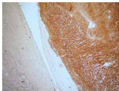
FIGURE 4. CD117 positive tumor tissue on the adjacent testicular parenchym structure, x 40