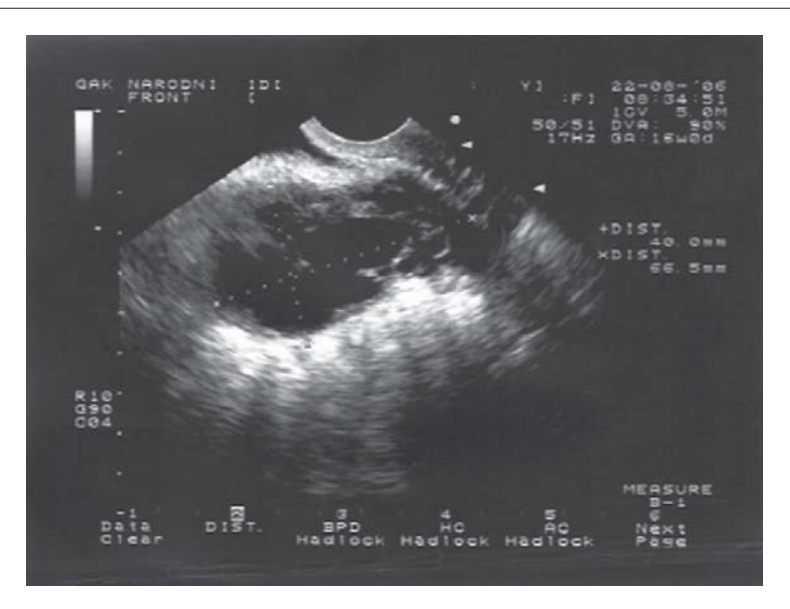
FIGURE 1. Invasive mole 32-year old patient (massive destruction of uterine wall) (between arrows)

Serum human chorionic gonadotropine has decreasing rate to the level of 2433 \, IU/l when started increasing again. According to increasing serum human chorionic gonadotropine (2720 \, IU/l , 3745 \, IU/l - 5691 \, IU/l in ten