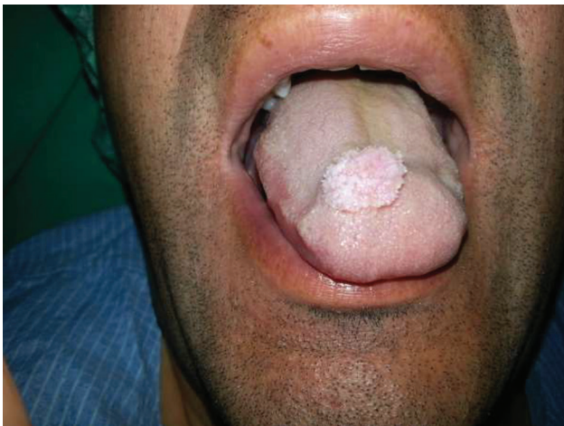
FIGURE 1. White verrucous lesion on the right side of the tongue