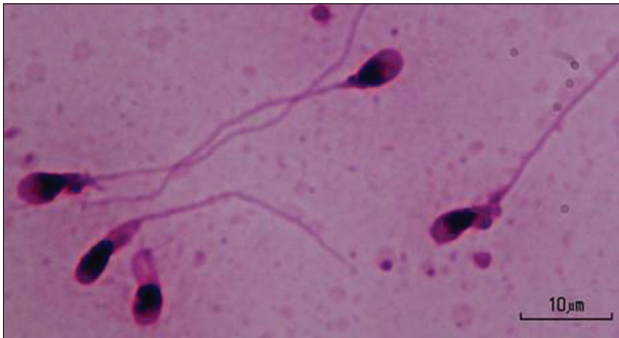
FIGURE 1. Evaluation of sperm cell morphology with Diff-Quick staining. Normal size, shape, and acrosome of the sperm head, without midpiece or tail defects, are considered as normal sperm morphology. Sperm cells that do not show these properties are considered as abnormal. Five sperm cells with abnormal morphology are shown in the figure. Bar = 10 \mu m.

cells between the described steps was performed using PBST (0.1% Tween 20/PBS). Figure 2A shows different localization patterns of PLC \zeta in sperm cells stained with DAPI and PLC \zeta immunofluorescence.