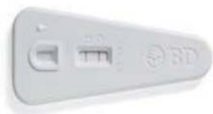
FIGURE 1. BD MGIT TBc identification test [13]

The statistical analysis of the results was performed using the Statistical Package for the Social Sciences (SPSS), version 14. Sensitivity, specificity, positive and negative predictive values of the examined diagnostic test were determined. The correlation of the results of the